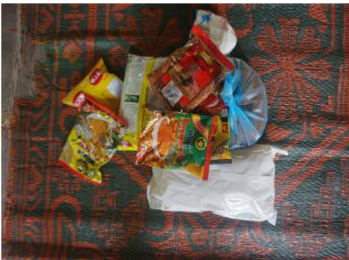
Food items that were distributed