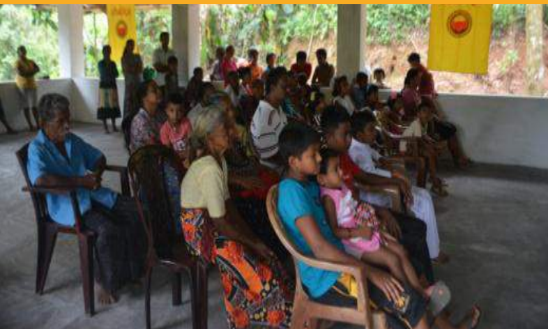
Activity being conducted at the centre