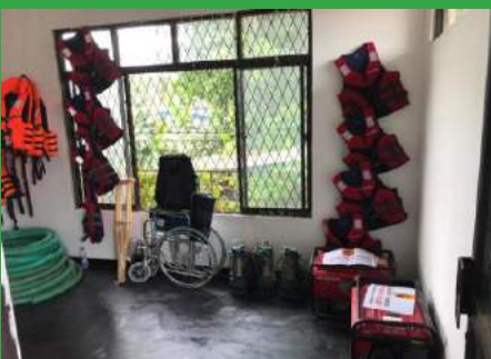
Rescue equipments that were distributed