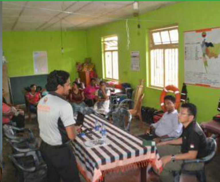
Review of Disaster Response Team's training