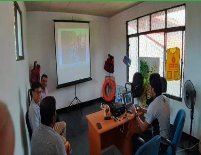
Distribution of medical and rescue equipments to community

By appointing and training community members to act as first respondents when providing relief in the occurrence of future disasters, this project enables the community to ready and prepare themselves by equipping them with the knowledge and skills necessary to prevail against adversity driven by disasters. This is also achieved by extending our efforts in the distribution of rescue, medical and kitchen kits to the community.