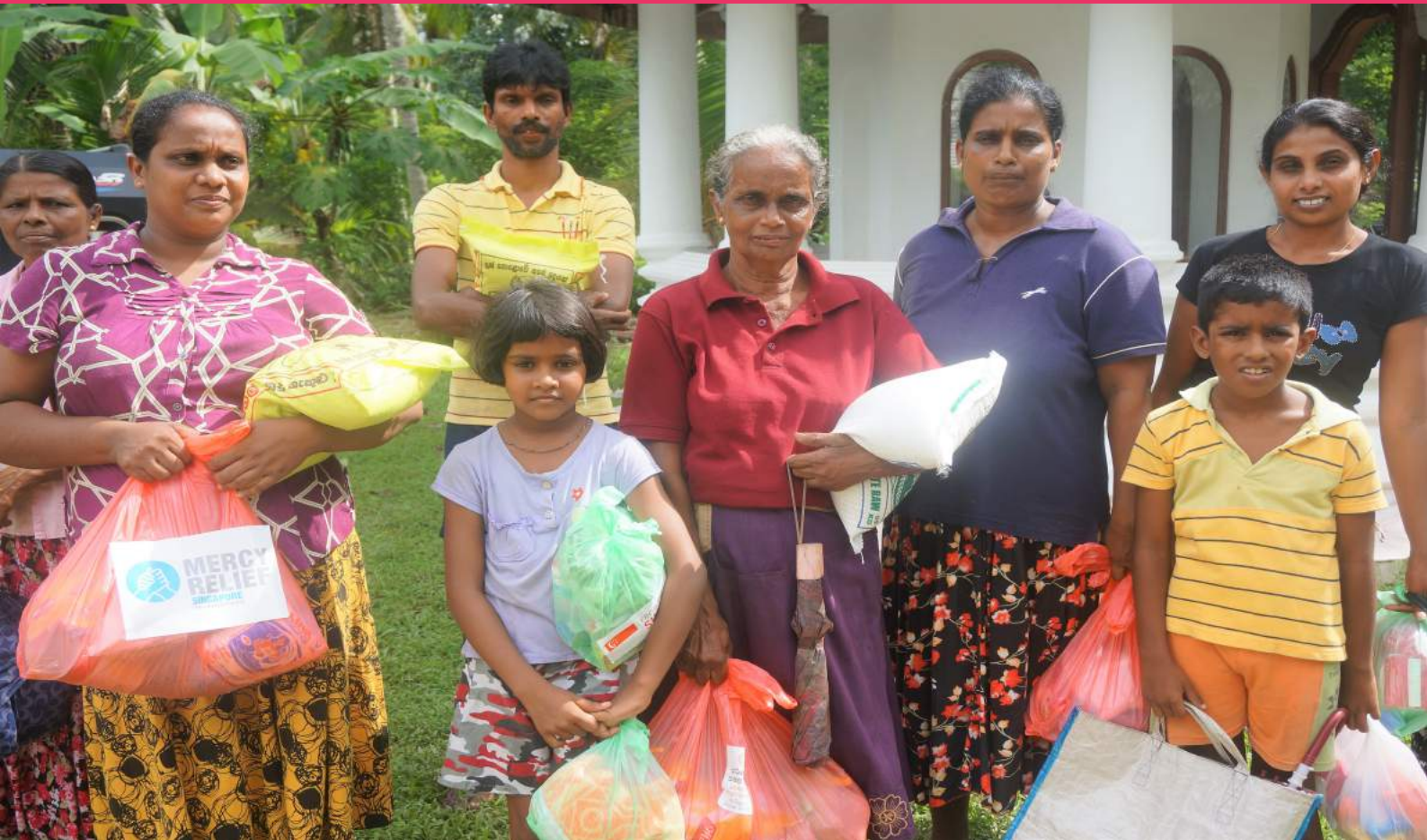
Distribution of food rations to community