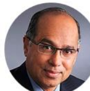
Thali Koattiath Udairam